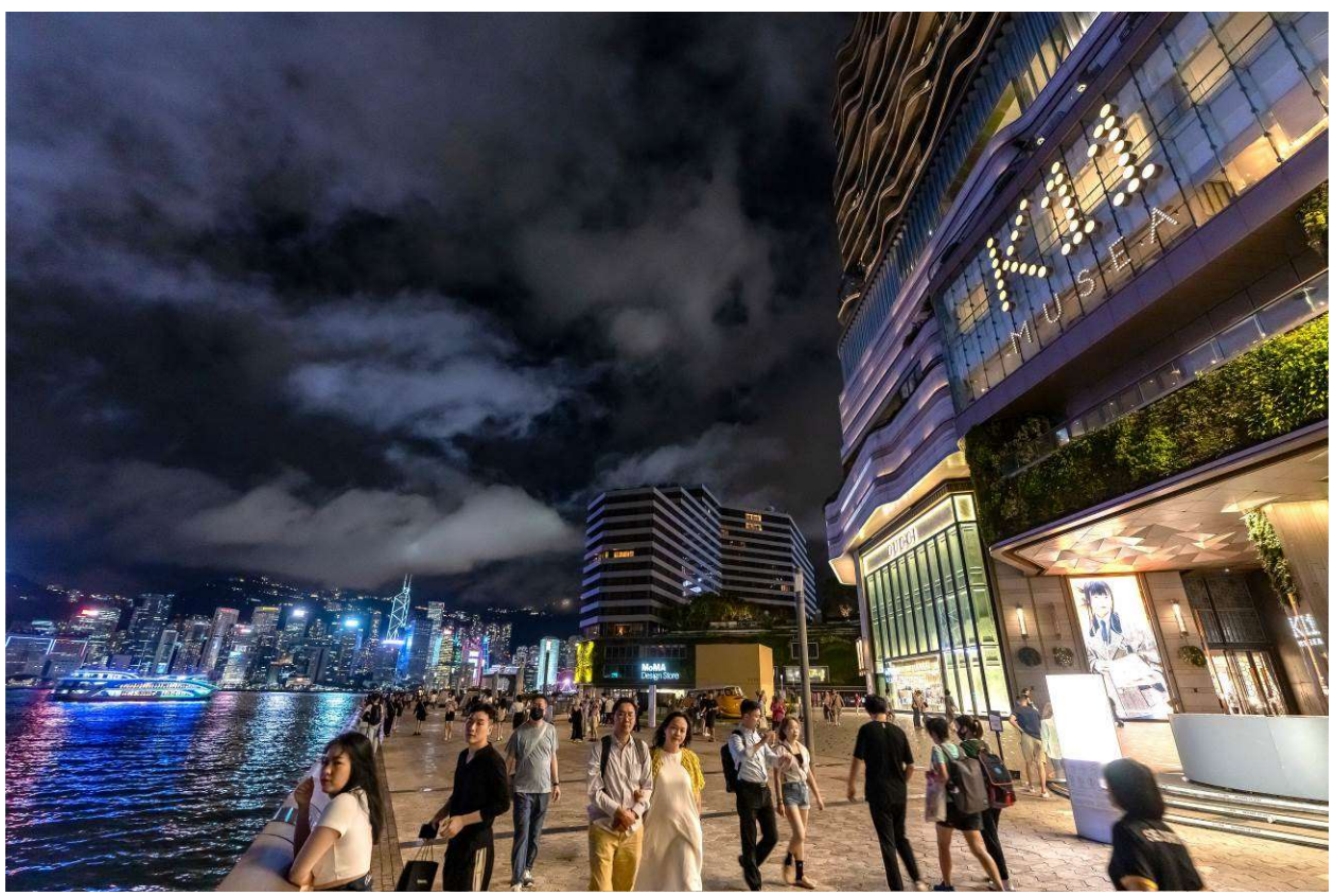
Starting from 22 September, the Avenue of Stars and K11 MUSEA will co-host "Night Market by The Sea" to drive the city's nighttime economy.

15 September 2023, Hong Kong – Starting from 22 September, the Avenue of Stars and K11 MUSEA will co-host its first-ever cultural waterfront market – "Night Market by The Sea" – throughout four consecutive Friday and Saturday nights to drive the city's nighttime economy. The open-air market offers diversified local and ethnic fermented handicrafts and specialty drinks produced by 30 local brands. The GDCD Association and Yau Tsim Mong District Office will organise the first-ever night "Star Run" on 22 September. The night run will lead participants through K11 MUSEA and wind its way along the Tsim Sha Tsui promenade, setting the stage for a new fusion of nighttime sports and entertainment and as kick-off of "Night Market by The Sea".